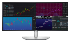
Dell UltraSharp 34 Curved USB-C Hub Monitor - U3423WE

Enhance your creative process with the Wacom Cintiq Pro 24. Featuring world-class color performance on one of Wacom's largest 4K screens.