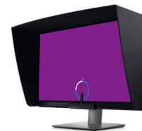
Dell UltraSharp 27 4K PremierColor Monitor - UP2720Q

Get immersive productivity on a 34" WQHD curved monitor with a wide color coverage and extensive connectivity including RJ45, USB-C and quick-access front ports.