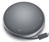
Dell Mobile Adapter Speakerphone - MH3021P

Collaborate with ease anywhere with this Teams certified wireless headset which offers active noise cancellation and smart sensors that automatically mute and unmute your call.