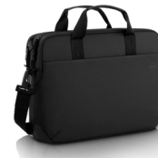
Dell EcoLoop Pro Briefcase - CC5623

Multiport adapter with integrated speakerphone offers an all-in-one connectivity and conferencing solution.