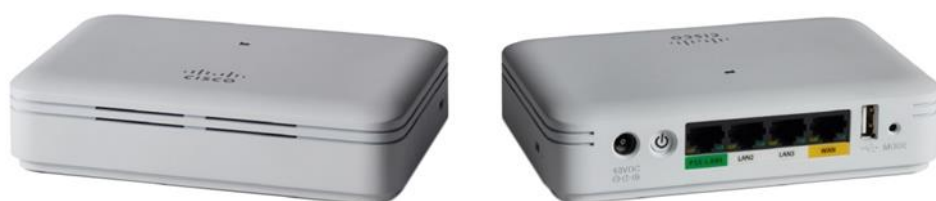
Figure 1. Cisco Aironet 1815t Access Point

The Cisco® Aironet® 1815t Access Point (Figure 1) offers a highly secure enterprise wired and wireless connection to the home, micro-branch, or any type of remote sites. No longer will geography or the elements play a role in delaying productivity, as the 1815t extends the corporate network to teleworkers, mobile workers, and even micro-sites. The access points connect to the home or on-site broadband Internet access and establish a highly secure tunnel to the corporate network. This tunnel allows remote employees access to data, voice, video, and cloud services for a network experience consistent with that at the corporate office. The 1815t supports highly secure access to corporate data and personal connectivity for teleworkers' home devices, with segmented home traffic.